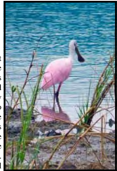
Spoonbill sighted at New Jarboe Park.

When the rains have come, the open areas where new topsoil was laid and the heavy construc-